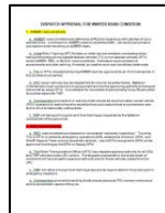
Dispatch Approval For Winter Road Conditions