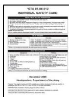
GTA 05-08-012 Individual Safety