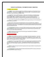
Dispatch Approval For Winter Road Conditions