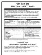
GTA 05-08-012 Individual Safety Card