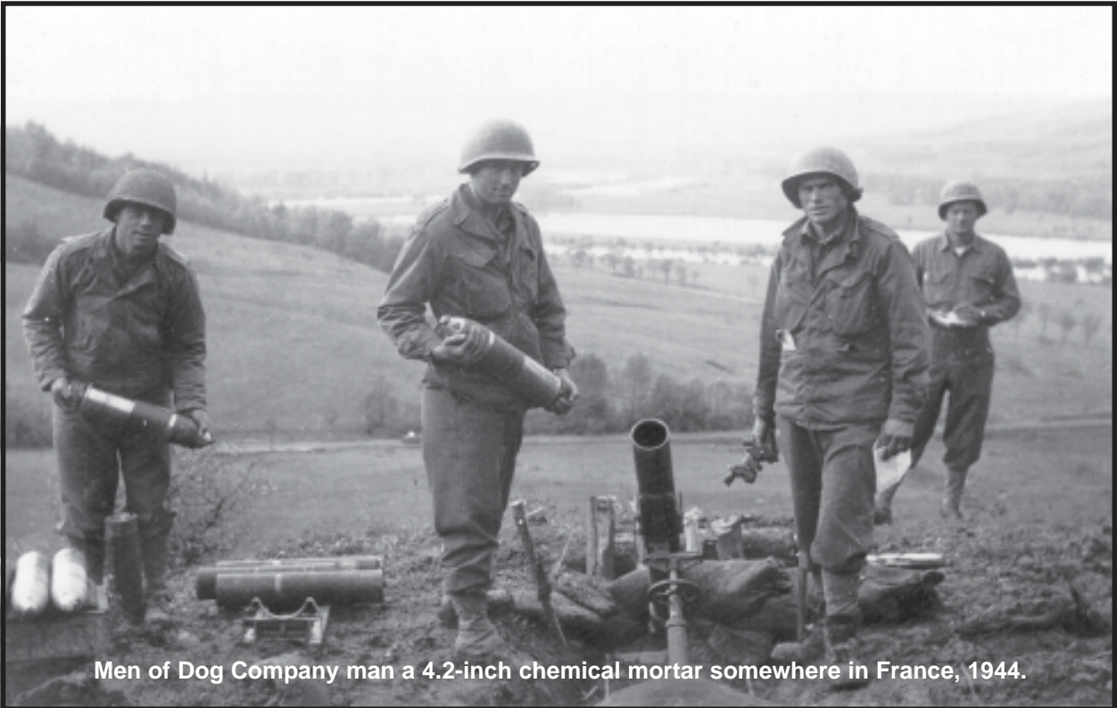
Men of Dog Company man a 4.2-inch chemical mortar somewhere in France, 1944.