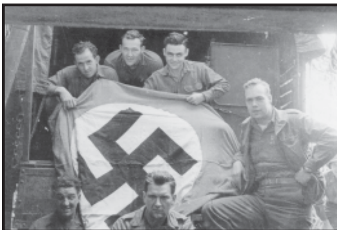
Men of Dog Company pose with a captured Nazi flag, Germany, 1945.

In the Norman town of Vierville-sur-Mer, France, a bronze plaque decorates the wall of the village